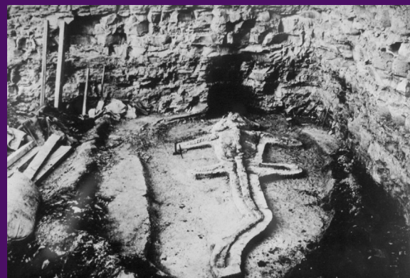
The ‘Stockton Ichthyosaur’ was found in 1898