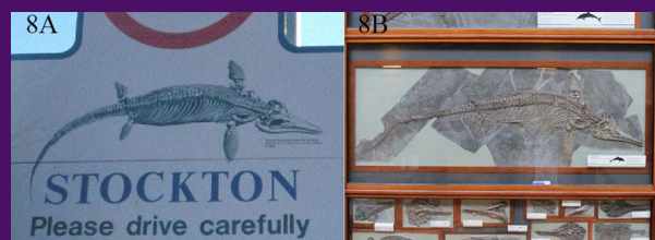
Stockton road signage features an image based upon a different specimen - NHUK PV OR2013, Ichthyosaurus somersetensis