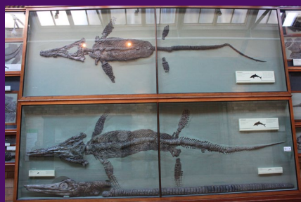
NHUK PV OR2918 (top)